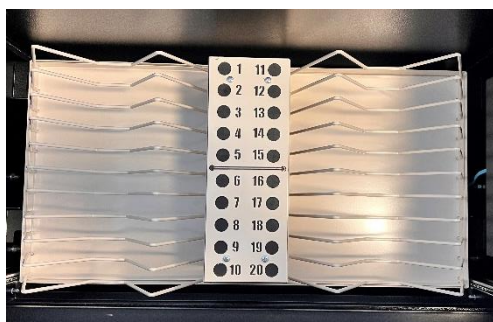
Interior storage on the 20 version

Easy cable management – no more cable mess